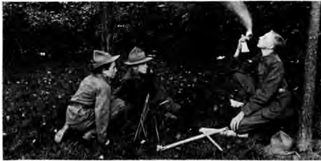
GETTING THE FLAME